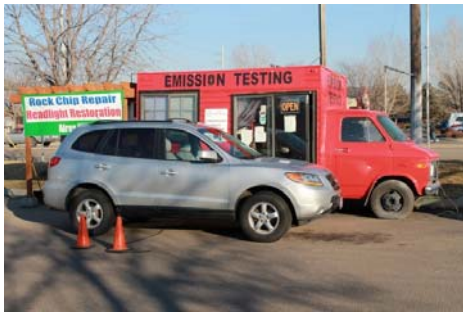
Emissions testing station, van (Aires WSR LLC, Boise) File name: 11_Ada_Van_WithCar