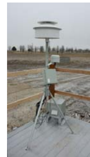
Fine particulate (PM 2.5 ) monitor DEQ air quality monitoring station (St. Luke's, Meridian) File name: 13_FineParticulateMonitor_SASS_Meridian January 2014