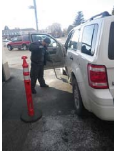
Visual inspection of emission control system (Larry's Chevron, Nampa) File name: 8_Visual_Inspection_Canyon