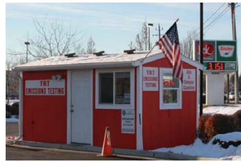
Emissions testing station, shed (Taylor's Rapid Test, Meridian) File name: 1_Emissions_Testing_Station_Shed_Ada