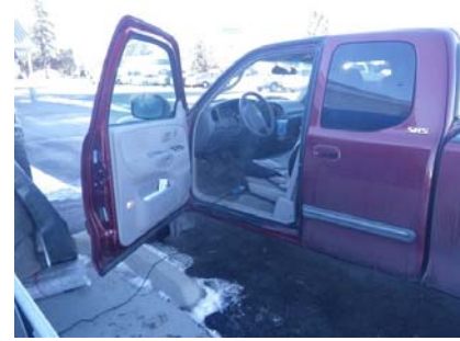
Emissions OBD-II test (Mobile Testing Station, Kuna) File name: 3_OBD_Inspection_Kuna