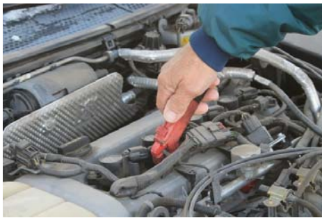
Obtaining an RPM reading (Taylor's Rapid Test, Meridian) File name: 7_RPM_Reading_Ada