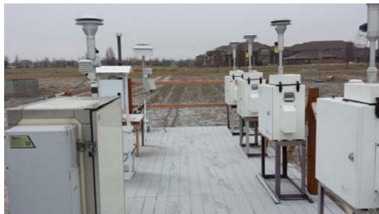
DEQ air quality monitoring station (St. Luke's, Meridian) File name: 15_MonitoringDeck_Meridian_Monitoring_Station