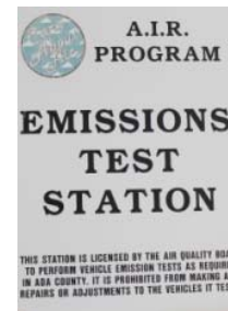
Ada County emissions testing station sign (Aires WSR LLC, Boise) File name: 9_Ada_Sign