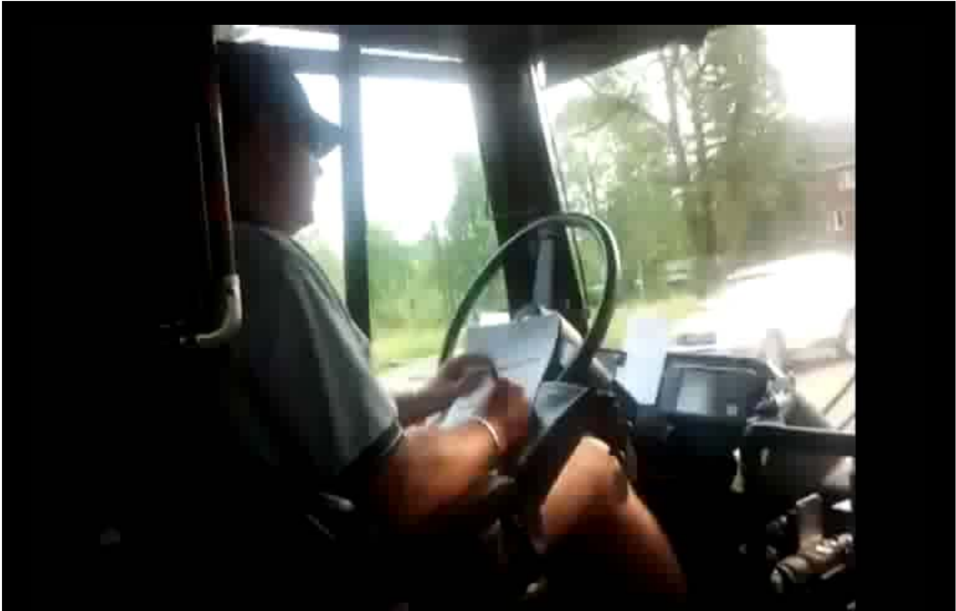
Quebec Bus Driver