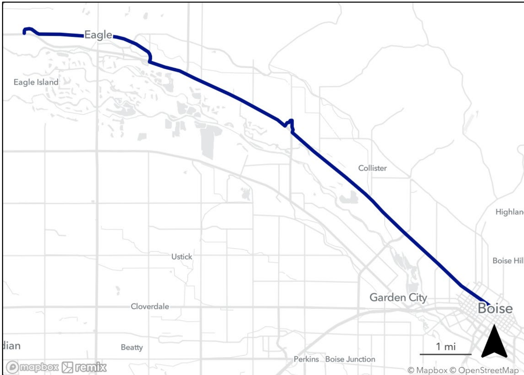
Figure1. Valley Regional Transit’s proposed State Street Premium Corridor