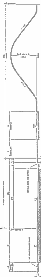
1 TYPICAL ISLAND STREET SECTION (HALF-SECTION) NOT TO SCALE - 1" = 10' HORIZONTAL