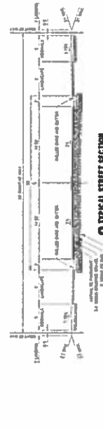
3 TYPICAL STREET SECTION NOT TO SCALE - 1" = 10' HORIZONTAL