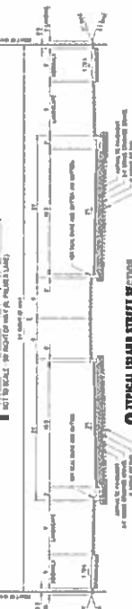
2 TYPICAL ISLAND STREET SECTION NOT TO SCALE - 1" = 10' HORIZONTAL