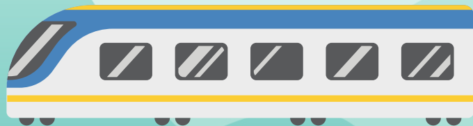
Mid-Distance: State-Supported Amtrak Service

This service is identified as an unfunded need in the regional long-range transportation plan. COMPASS, with multiple partners, is working on a "Planning and Environmental Linkages" study, which will move the project closer to being eligible for federal funding.