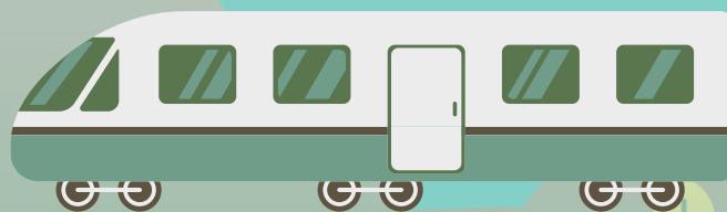
Long-Distance: Pioneer Line Amtrak Service

In 2023, the lead agencies applied for a grant to fund a "service development plan," but did not receive it. They are currently exploring other funding opportunities.